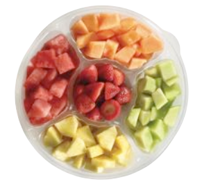
Fresh Fruit To-Go Refreshing classics including watermelon, cantaloupe, honeydew, pineapple and strawberries. Serves 8-10.