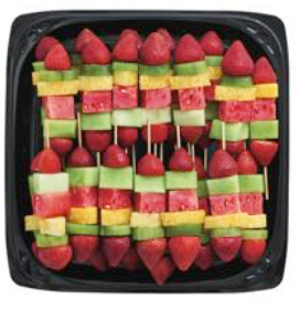
Fresh Fruit Kabobs Fruit is more fun when served kabob-style. Includes kiwi, honeydew, pineapple, strawberry and watermelon. Serves 24.