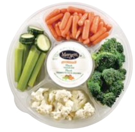
Fresh Veggies To-Go Complement any meal with crunchy baby carrots, broccoli, cauliflower, celery and cucumber. Served with classic ranch dip. Serves 8-10.