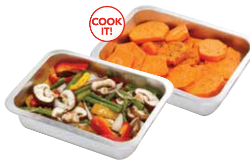
Ready-to-Cook Grillers and Roasters Grilling and roasting bring out the best in veggies. See in store or online for full selection. Assortment may vary seasonally. Serves 4-5.

Crisp broccoli florets, sugar snap peas, baby carrots, English cucumbers and grape tomatoes. With classic and roasted garlic hummus for dipping. Serves 6.