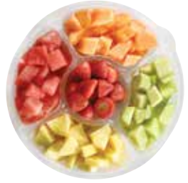
Fresh Fruit To-Go Refreshing classics including watermelon, cantaloupe, honeydew, pineapple and strawberries. Serves 8.