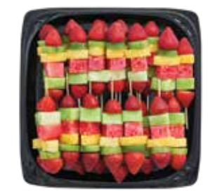
Fresh Fruit Kabobs Fruit is more fun when served kabob-style. Includes kiwi, honeydew, pineapple, strawberry and watermelon. Serves 24.