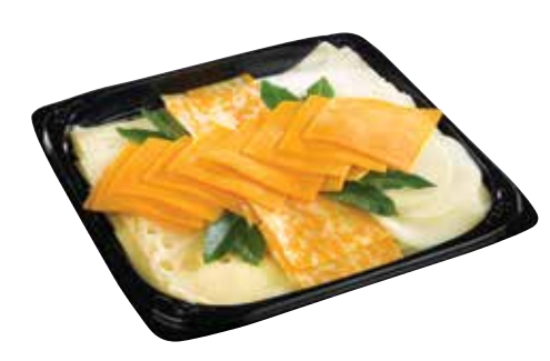
Sliced and Ready

Conveniently sliced for building amazing sandwiches. Includes cheddar, provolone, creamy havarti, Swiss and marble cheddar. Serves 15.